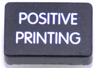
Silk screen positiv print