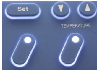
Two layer Night design