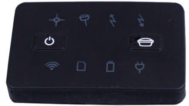
Combination with spray, laser and print