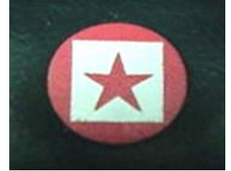
Three layer Night design