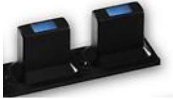
One layer Light control