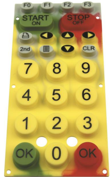
Silicone keypad with silk screen print