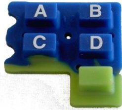
Silk screen printing